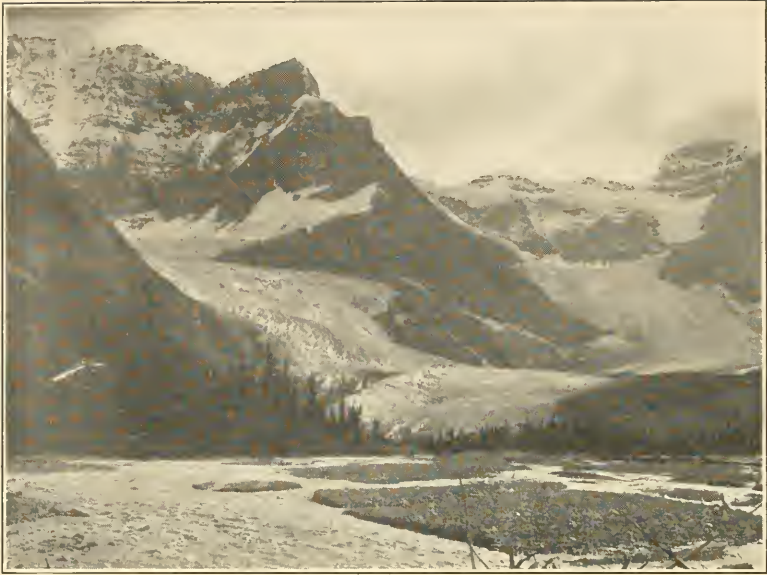
GABLE AND ALEXANDRA GLACIERS IN NASHAN-ESEN VALLEY.